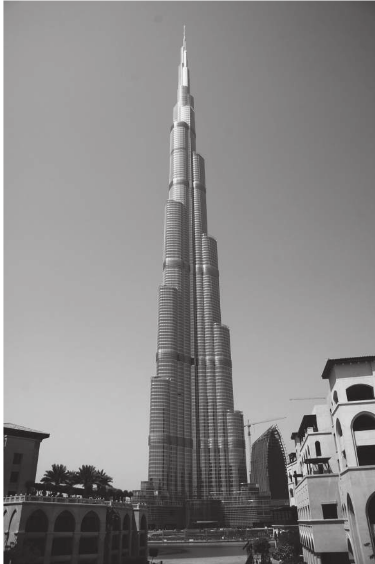
Fig. 1 for Question 1

The Burj Khalifa is a skyscraper in Dubai. It is the tallest structure in the world standing at over 800 metres. The Burj Khalifa is a recognised tourist attraction which has: